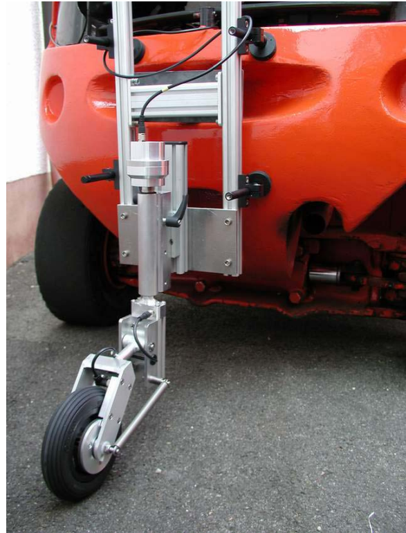
5W-6 Miniwheel with H-adaptor and magnetic holders at the rear of a forklift truck